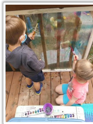
Painting outside in the beautiful weather this week!