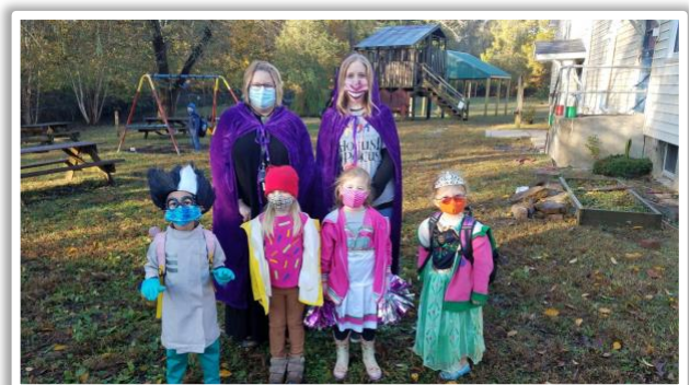
Can you guess who is who in these fun costumes????